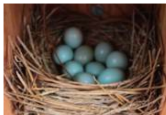
Nine eggs in box (above) Four chicks hatched (right)

In early June, a pair of bluebirds laid four eggs in our bluebird box. Then the parents appeared to abandon the nest shortly afterwards, with only the female visiting the box occasionally until mid-July. At that point, we discovered that there were nine bluebird eggs in the nest, and a new pair of bluebirds were tending the nest. Four of the eggs hatched and fledged on August 11. Now only three eggs remain in the nest. We can only speculate as to what happened to the first pair of bluebirds, and whether any of the eggs that hatched were from the earlier laying.